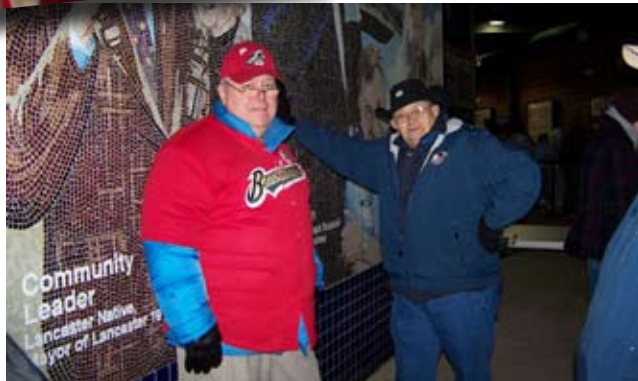
Booster Club members meet in the early morning on Christmas Eve to distribute food to Lancaster's families in need.