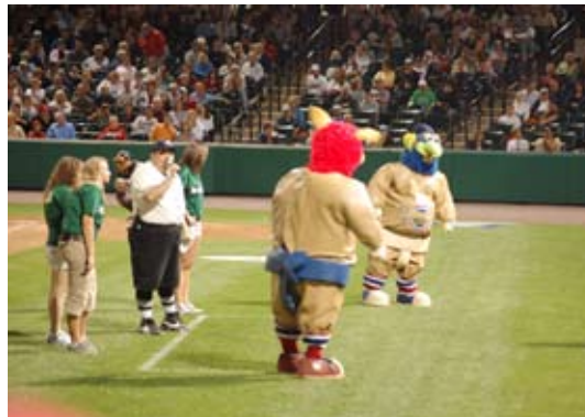
Cylo & Downtown sumo wrestling at a York game at the end of the 2008 season