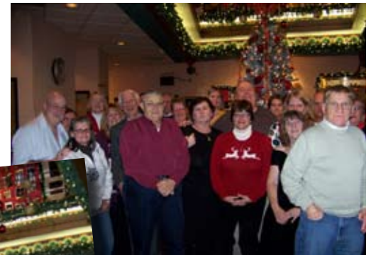
The Booster Club gathers by the Christmas Tree in the Dutch Apple Dinner Theatre lobby.

We all had a great time at our First Annual Holiday Gathering, held at Dutch Apple Dinner Theatre in December. Our members enjoyed a wonderful buffet and were dazzled by an enthusiastic performance A Christmas Carol .