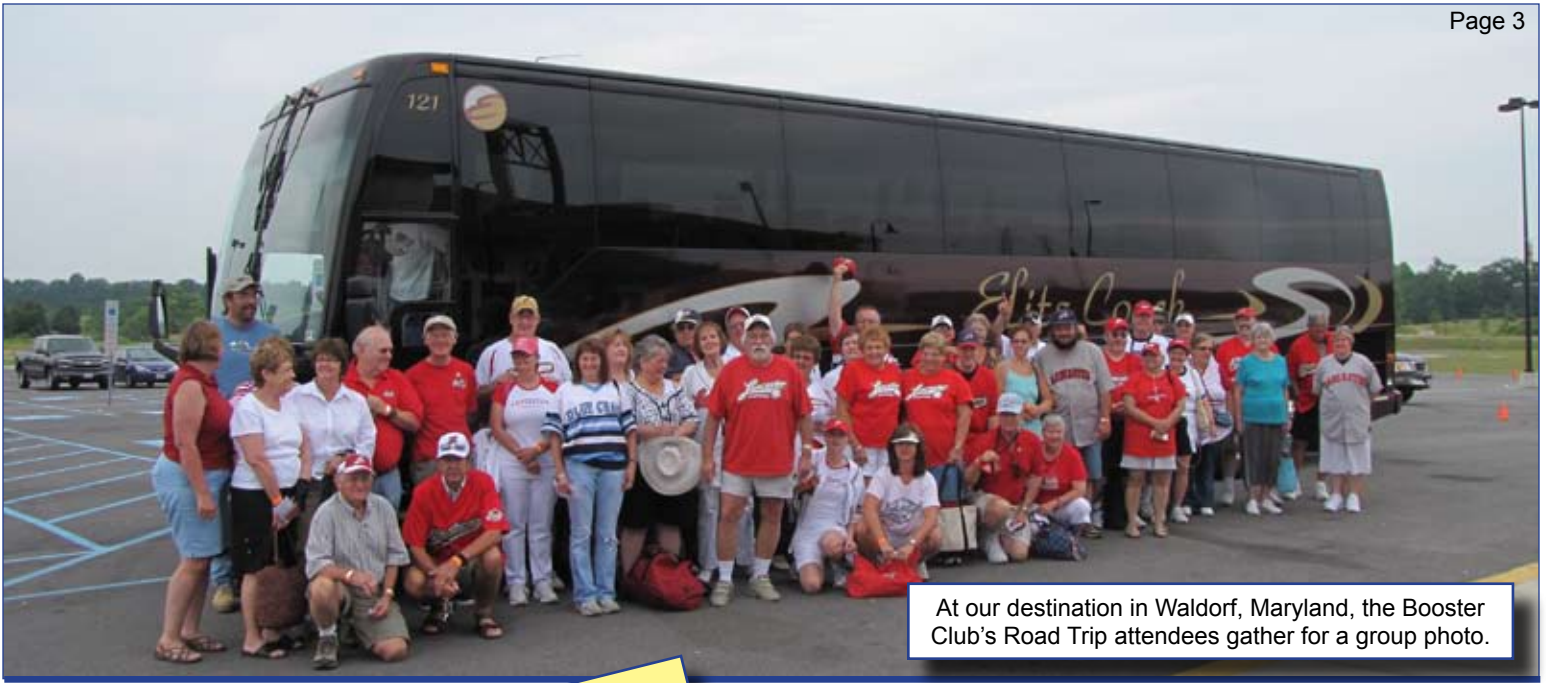
At our destination in Waldorf, Maryland, the Booster Club's Road Trip attendees gather for a group photo.