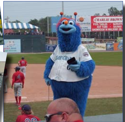
The Blue Crabs' mascot, Pinch, reacts (as did some SOMD fans) to our loud chanting of each batter's name as our boys came up to the plate. We made our presence known.

We then toured the picnic area, bumper boats, and batting cage. We got to see the back and the front of the manual scoreboard. We then went out onto the field to visit the home dugout and learn about their press box and suites.