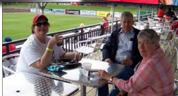
A great time was had by all at the Spring Training Picnic!

the transportation, 2-hour all-you-can-eat picnic, stadium tour, and the chance to meet the Maryland Booster Club. The deadline to order tickets has been extended to June 12th. This trip is open to the public, and you may invite your friends to go along. This will be a wonderful opportunity to for them to see what it's like to be a Booster.